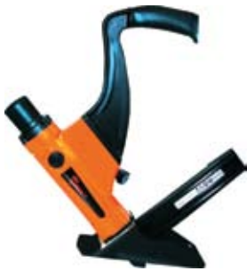
L Cleat Nailer w/Spacer